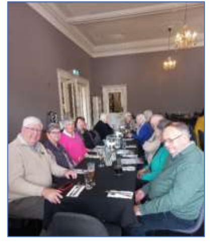
Seppelts underground tour 23 April For more, go to Club News at <a href="https://probusballaratgardens.org.au/blog">https://probusballaratgardens.org.au/blog</a>