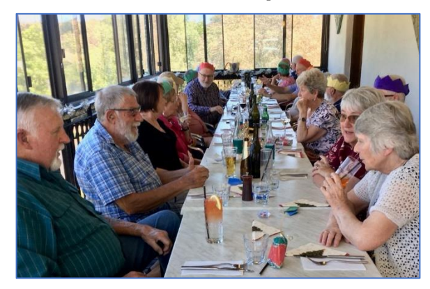
Final Dine-Out: Rubens @ Hepburn