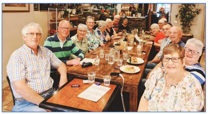
Walking Group Christmas Lunch at the Olive Grove